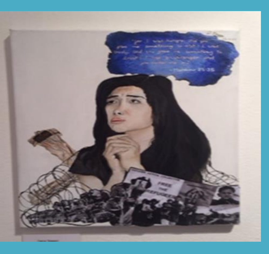
No one chooses to be a refugee