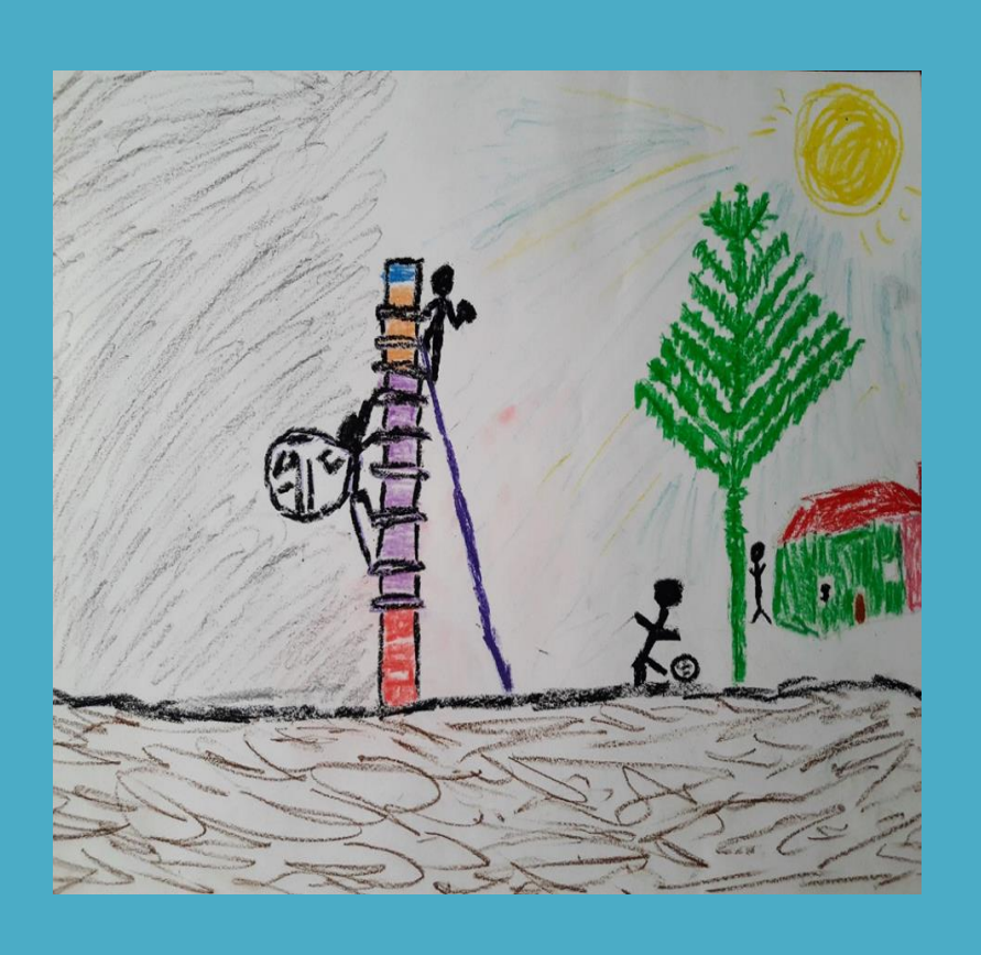
The barriers I need to overcome to reach a brighter future